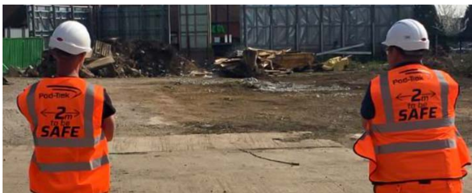
Uniform signage for workers to provide clear messaging

Establishing host responsibilities relating to COVID-19 and providing any necessary training for people who act as hosts for visitors.